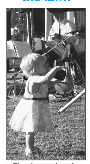
There's something for everyone on Australia Day, though some prefer the musicians to the speeches!

COTTESLOE'S Australia Day Awards will be presented on Saturday, January 26 at joint community celebrations hosted this year by Cottesloe. Every year the Town combines with the Shire of Peppermint Grove and the Town of Mosman Park for a celebration breakfast.