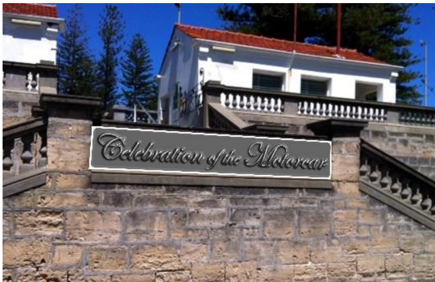
Previously approved location for main sign at public entrance.

7.00-8.30 Signs placed temporarily to indicate display areas 7.00-8.00 Signs placed (event & direction signs) 7.00-8.30 Tents erected 8.00 Food and Beverage set-up begins 8.00 Briefing for car placing marshals 8.00-9.00 Trade display stands set-up 8.00-8.30 Entry area & gate prepared and manned 8.30 Car entry gate opens – marshals in place 8.30-10.00 Cars arrive and placed 9.30-10.30 Ribbon squads operational 9.00-3.30 Food & Drinks available 10.30-3.30 Gate open to public 12.00-12.30 Judging conducted 1.00-1.30 Awards announced, charity auction 3.30 on Ribbons & poles removed and cars may leave