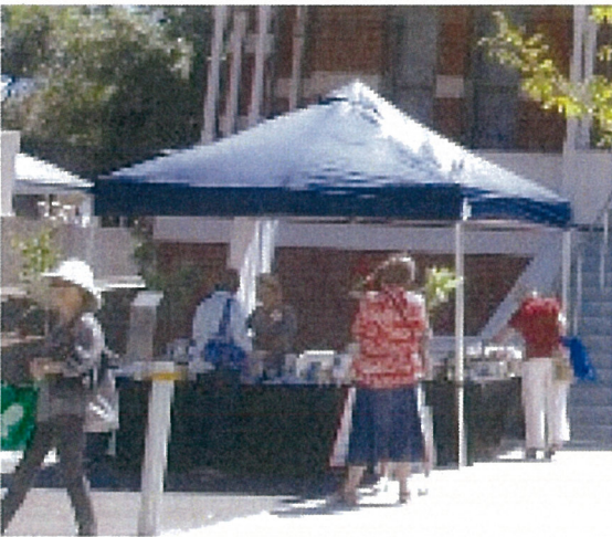
Example of 3m x 3m gazebo which will be set up at the concert for sale of concert tickets, cakes and water.