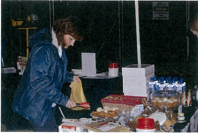
3m x 3m Stall featuring water, cakes and muffins for sale at the event – all proceeds to Cancer Support WA