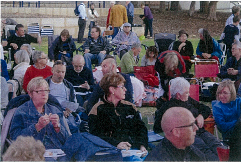
Concert attendees – bring along blankets, low chairs, picnic and byo drinks to enjoy at the concert.