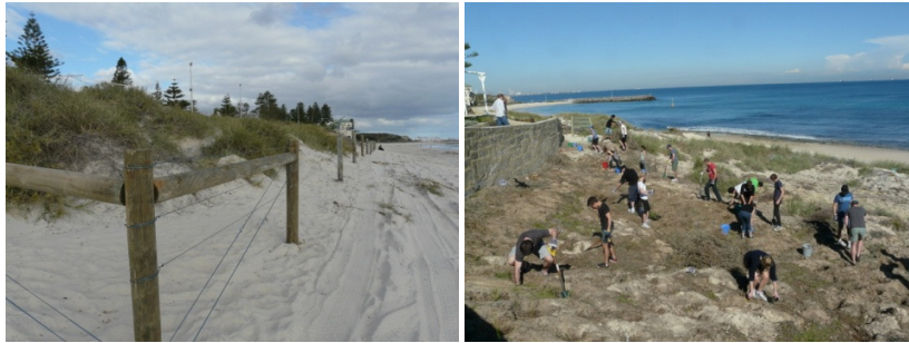
Photo (L) new fence. Photo (R) volunteers planting at Napier St foredune 2011