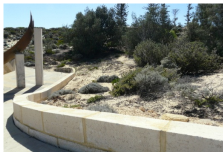
(L) – Quintilian students planting. (R) limestone retaining wall