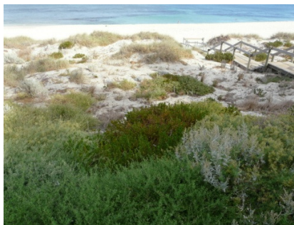
Photo (L) sea spinach and tea tree 2011. Photo (R) new ramp on north side with local plant species establishing - 2012