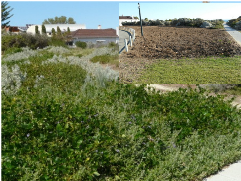
Eastern side of Grant Marine Park 2009 (inset) and 2012