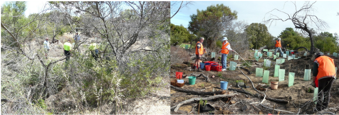
(L) Victorian tea tree being removed 2009 (R) CCA volunteers planting (same site) 2009

Revegetation – Since 2009 - each year CCA has planted approximately 500 native seedlings, using local provenance seed, collected and cleaned by CCA. Many species are specific only to this one natural area in Cottesloe – including Lechenaultia linarioides , Scaevola anchusifolia and Xanthorrhoea preissii .