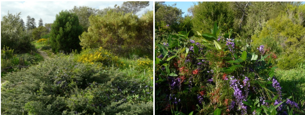
The same area at Cottesloe Native Garden in July 2014