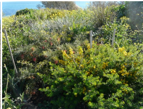
Mudurup Rocks same site 2012