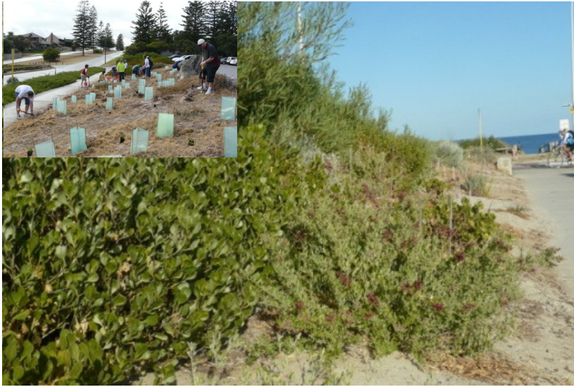
Grant Marine Park Verge 2009 (inset) and 2011