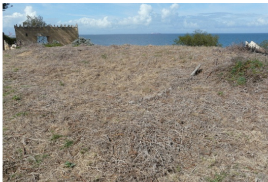
Mudurup Rocks 2009

Staff from Synergy and from Coca Cola assisted with planting and weeding. Quintilian and Hale School students also joined in planting sessions.