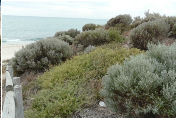
2010 after follow up planting