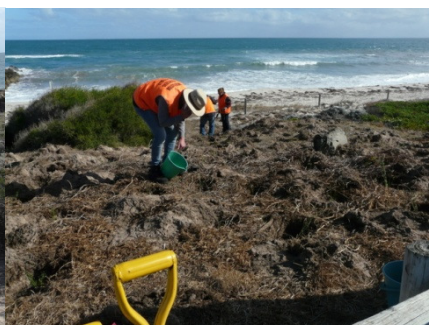
(L) planting south of Dutch Inn groyne 2008 (R) planting north of Dutch Inn groyne 2014