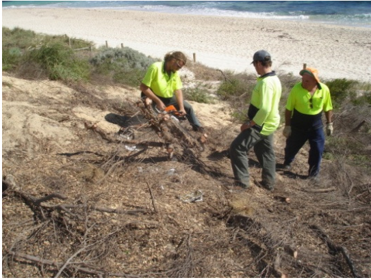
2007 removing Victorian Tea Tree

CCA had a revegetation project at the site in 2007. During 2008-9 hand weeding and infill planting work was carried out by CCA. Approximately 500 extra seedlings planted by CCA in 2010.