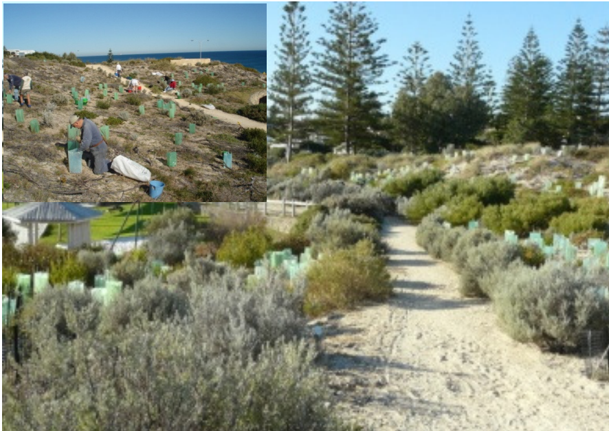
Grant Marine Park images 2007 (inset) and 2010

There is on-going disturbance at the site, primarily from children playing in the sand dunes.