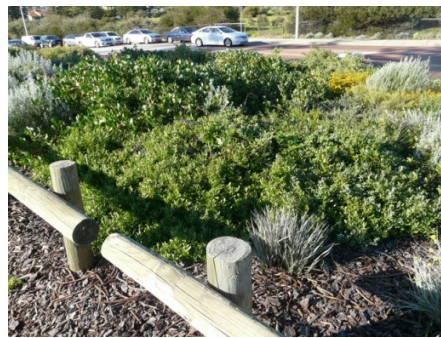
Mudurup rocks verge - new fence and weeds sprayed – (R) same site 2012