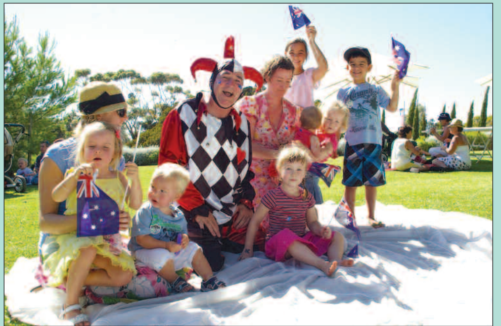
There’s always lots of family fun at the Councils’ Australia Day celebrations!

Presentations of local Council’s awards to their Citizen of the Year, Young Citizen, and Community Group/Event are also made on this day.