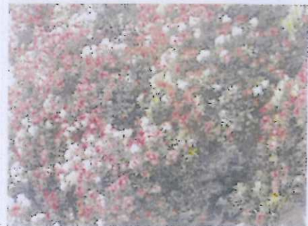
A Pōhutukawa around Mount Maunganui

In New Zealand, the Pōhutukawa is under threat from browsing by the introduced common brushtail possum which strips the tree of its leaves. [1] A charitable conservation trust, Project Crimson, has the aim of reversing the decline of Pōhutukawa and other Metrosideros species - its mission statement is "to enable pohutukawa and rata to flourish again in their natural habitat as icons in the hearts and minds of all New Zealanders".