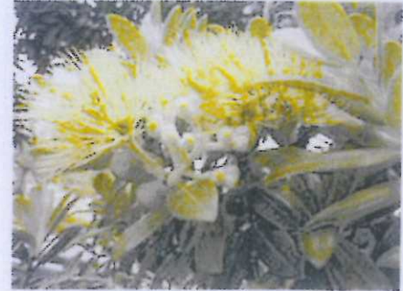
The yellow-flowering "Aurea" cultivar

The Pōhutukawa grows up to 25 metres (82 ft) in height, with a dome-like spreading form. It usually grows as a multi-trunked spreading tree. Its trunks and branches are sometimes festooned with matted, fibrous aerial roots. The oblong, leathery leaves are covered in dense white hairs underneath. [6]