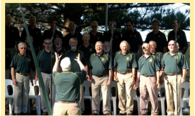
The popular Men in Harmony at last year's Australia Day