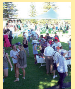
Australia Day in 2011 - celebrated at the Civic Centre.

Expect all the trappings - stirring songs from Men in Harmony, entertainment for the children, the