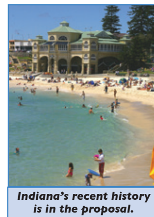
Indiana's recent history is in the proposal.

Council invites residents' input to planning a much-improved public facility