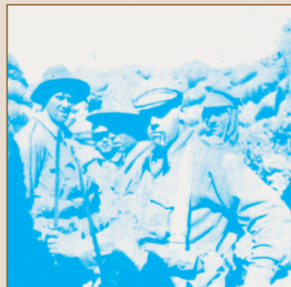
Diggers in the Gallipoli trenches.