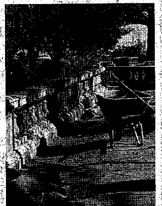
Renovating the Civic Centre: Eric St sale will help finance the work.

More than $1.5m will go to these Town assets - and enhanced safety at Curtin