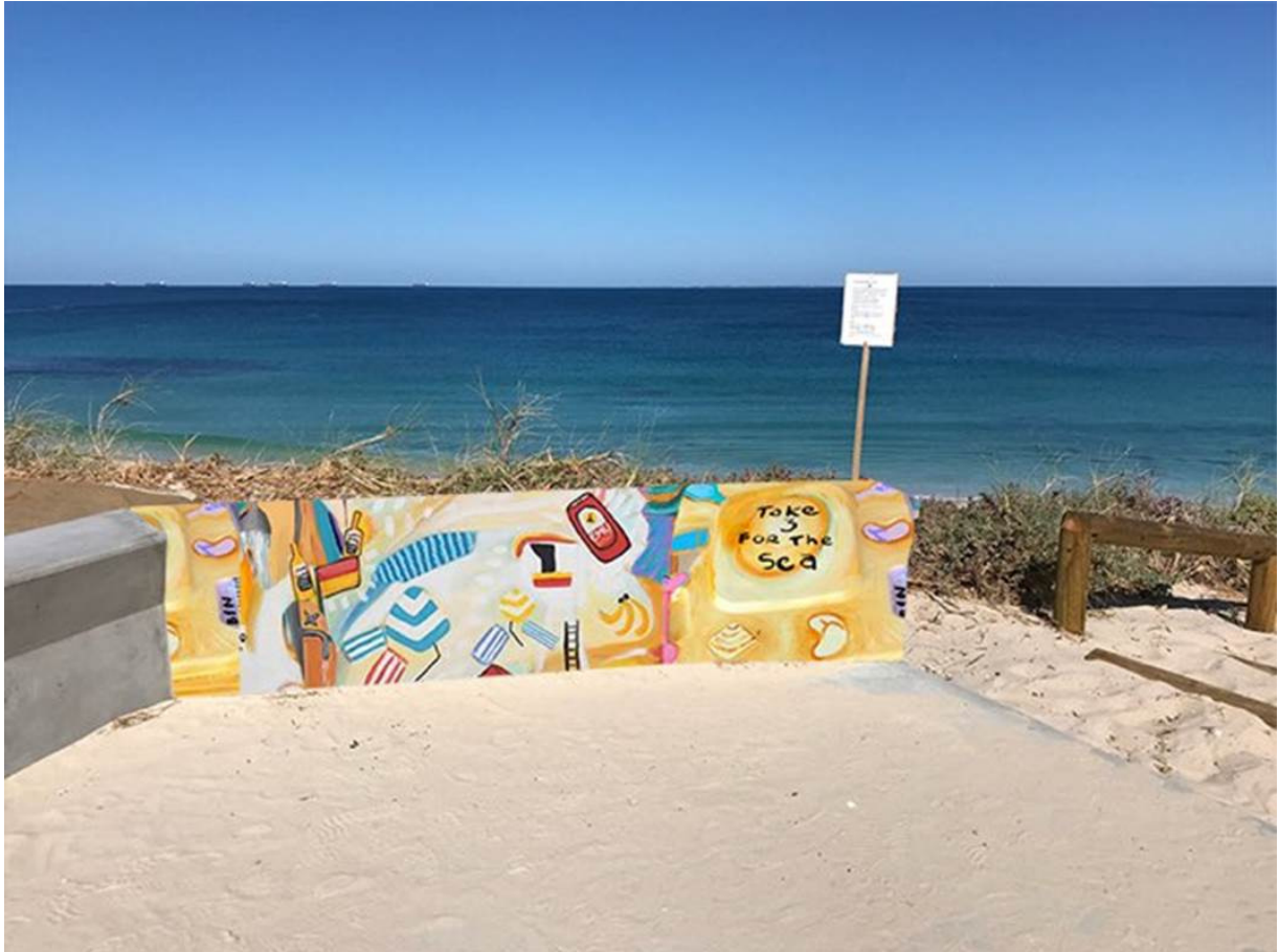
Proposed 'Take 3 by the Sea' artwork - North Cottesloe Surf Life Saving Club