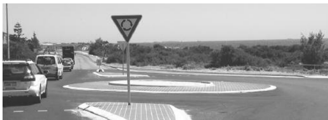
New roundabout at Marine Parade/Curtin Avenue: resolving the Curtin Avenue/railway divide is in the Future Plan.

IN coming months residents will be extensively consulted on the future direction of Cottesloe. The Town's Plan for the Future sets out broad objectives – and is reviewed at least every two years. An overview is included in the current Annual Report, available at the Civic Centre.