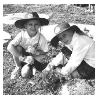
Year 1 children planting trees this year.