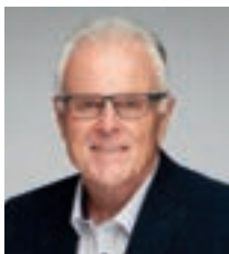
Cr Philip Angers - Mayor