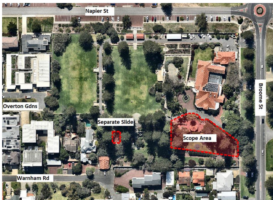
Figure 1: Existing Playground Area

The Civic Centre playground is located within a unique heritage garden on the southern lower level of the Civic Centre grounds on the corner of Broome and Napier Streets. The existing playground location and facilities are presented below.