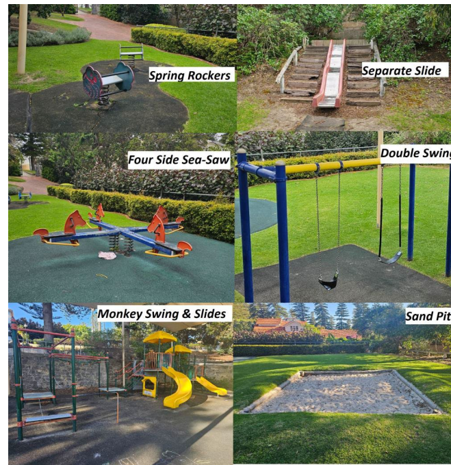
Figure 2: Existing Facilities

The working group is asked to discuss and provide feedback on: