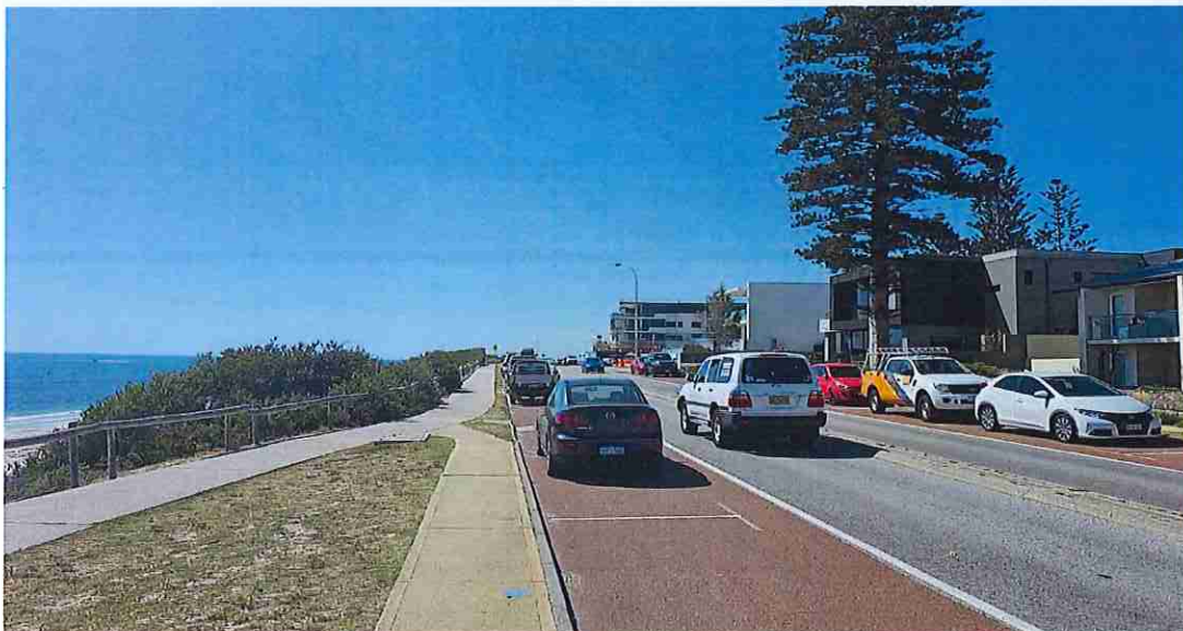
Marine Parade (adjacent Macarthur St)