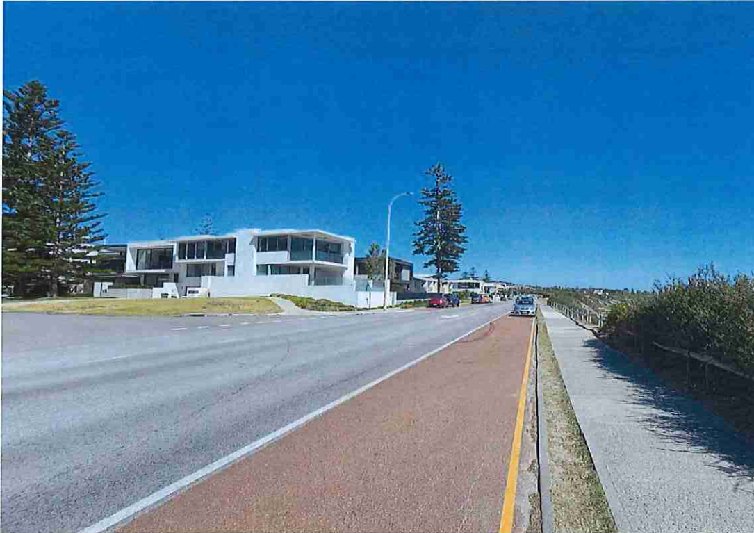
Marine Parade (adjacent Warton St)