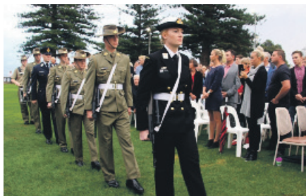
A Catafalque Party from the Australian Defence Force Academy presented arms at the 2016 ANZAC Day service.

It was wonderful to see so many people attend the Town of Cottesloe and Cottesloe RSL ANZAC Day service on Monday, 25 April.