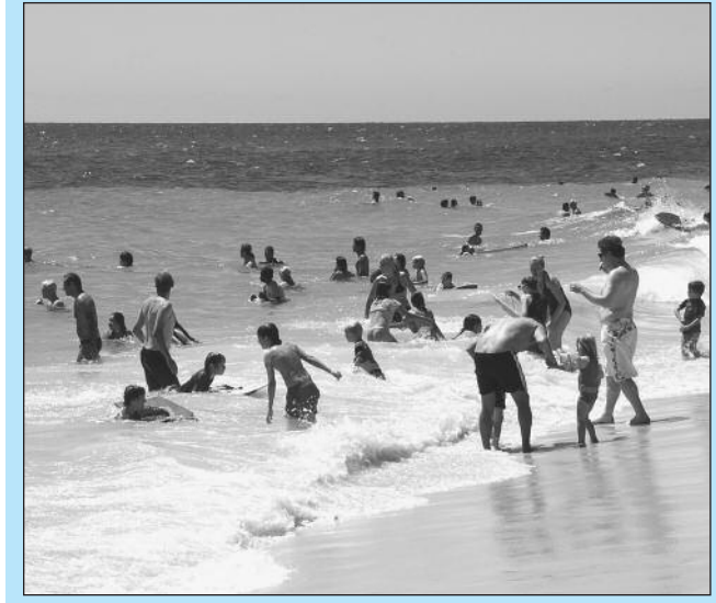
Thousands of swimmers are expected at Cottesloe

COUNCIL has sanctioned an attempt on a world record this month by up to 4,000 swimmers.