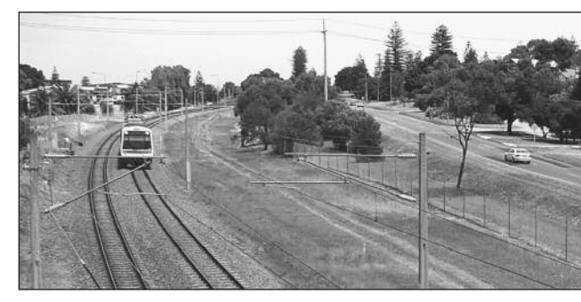
Curtin Avenue and railway lands will be discussed.

During the evenings of the workshops there will also be